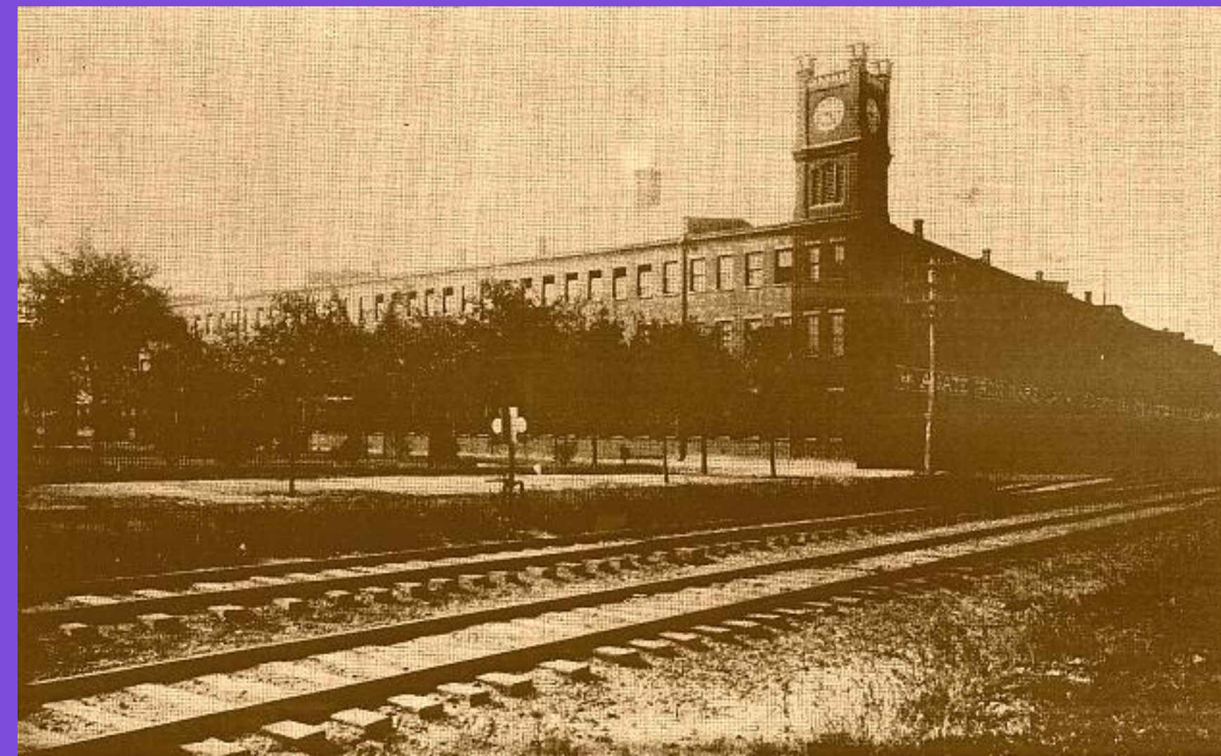
Grosjean Factory (c. 1876), clocktower still stands