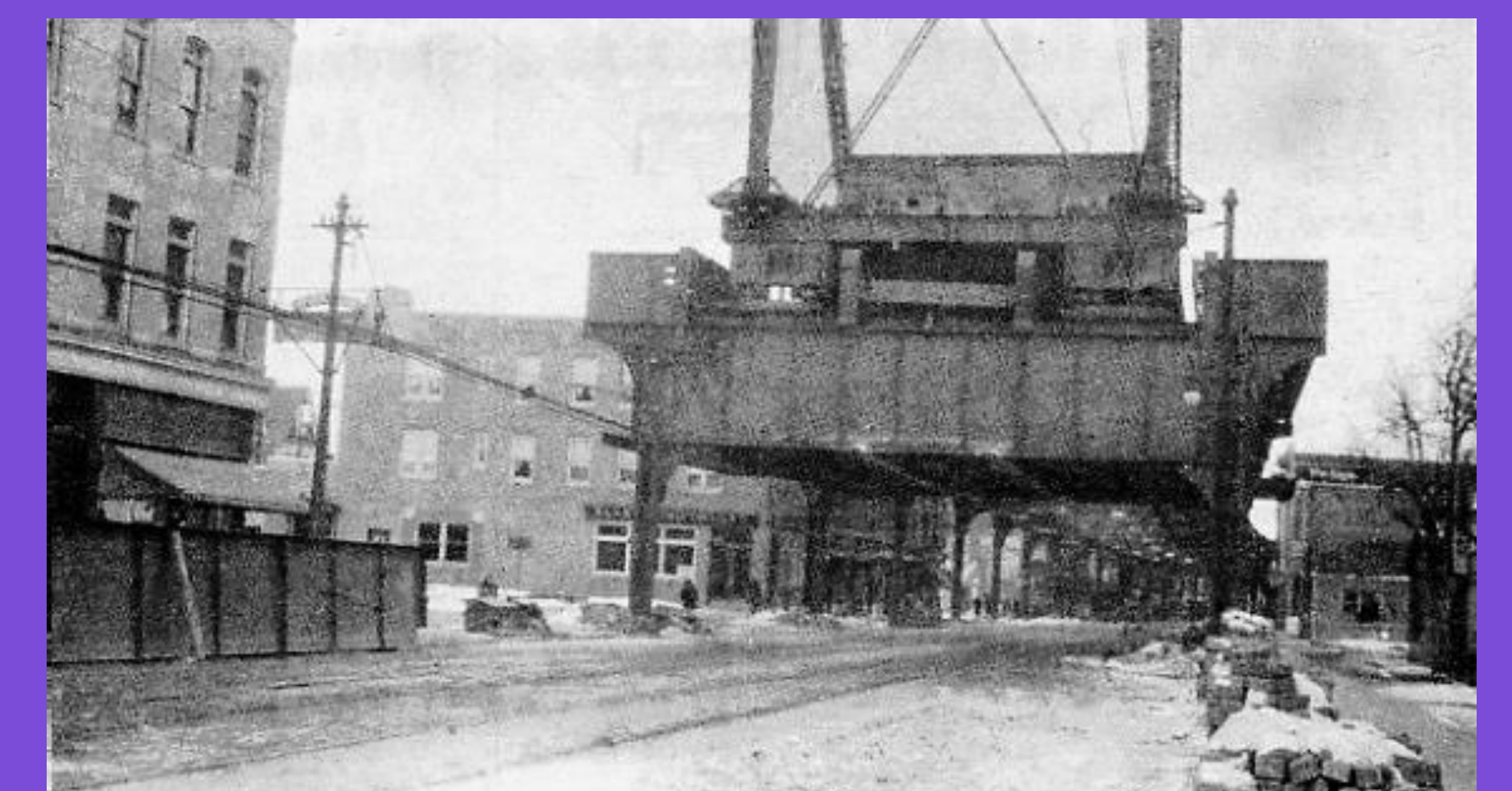
1916 construction of elevated train