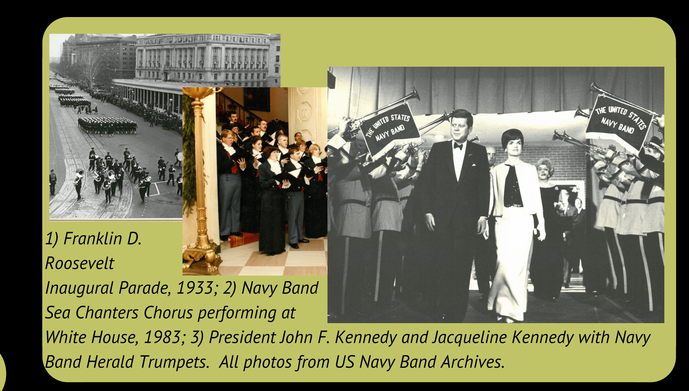
Exhibit will be available on Navy Band website for research and general interest.