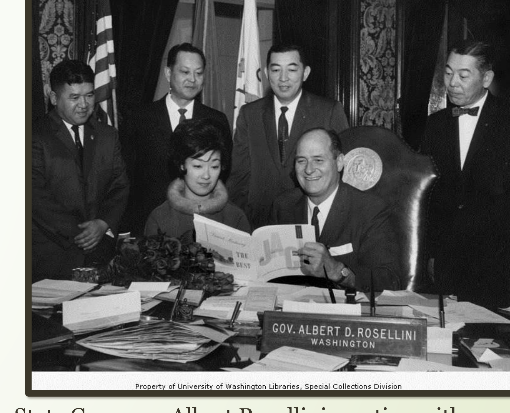
Washington State Governor Albert Rosellini meeting with a contingent of the Japanese American Citizens League (JACL) at the Olympia Federal Courthouse building, Olympia, January 31, 1962