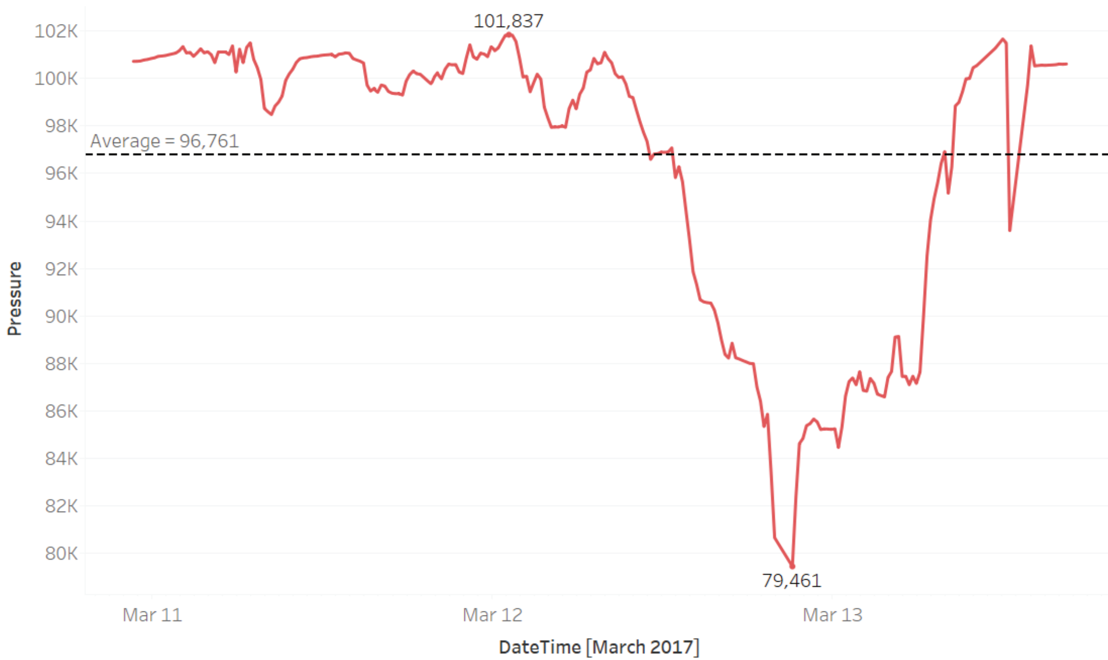
Pressure variation along the shipment duration