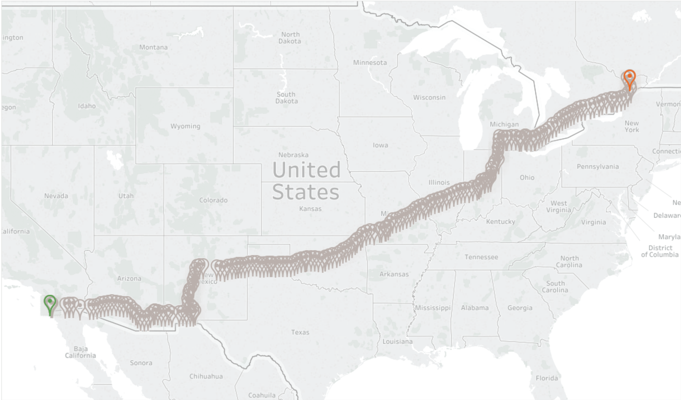
Map of shipment route through road transport