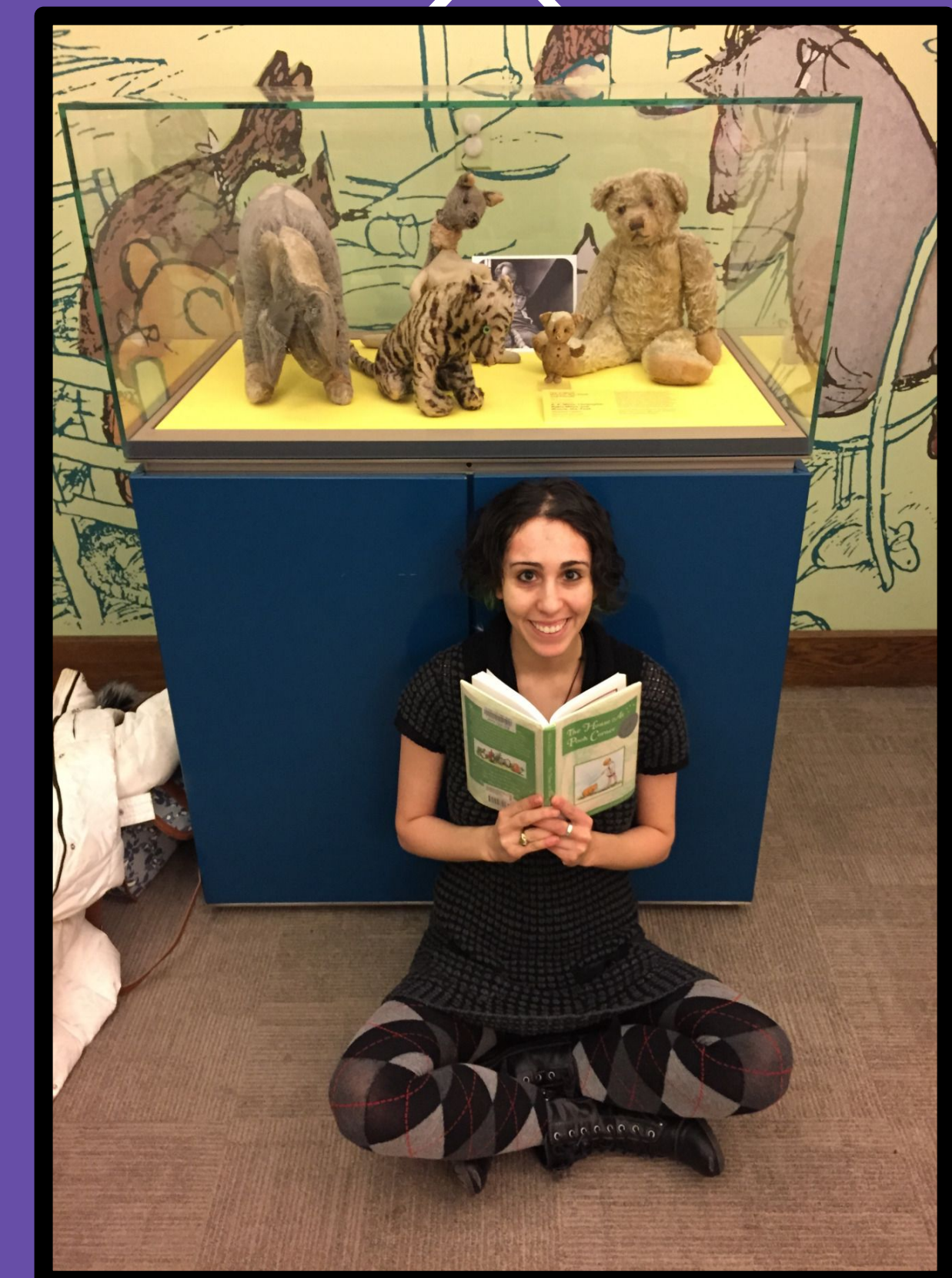
Central Children's Room, Donnell Library Center, New York Public Library with the real Winnie-the-Pooh stuffed animal and friends.