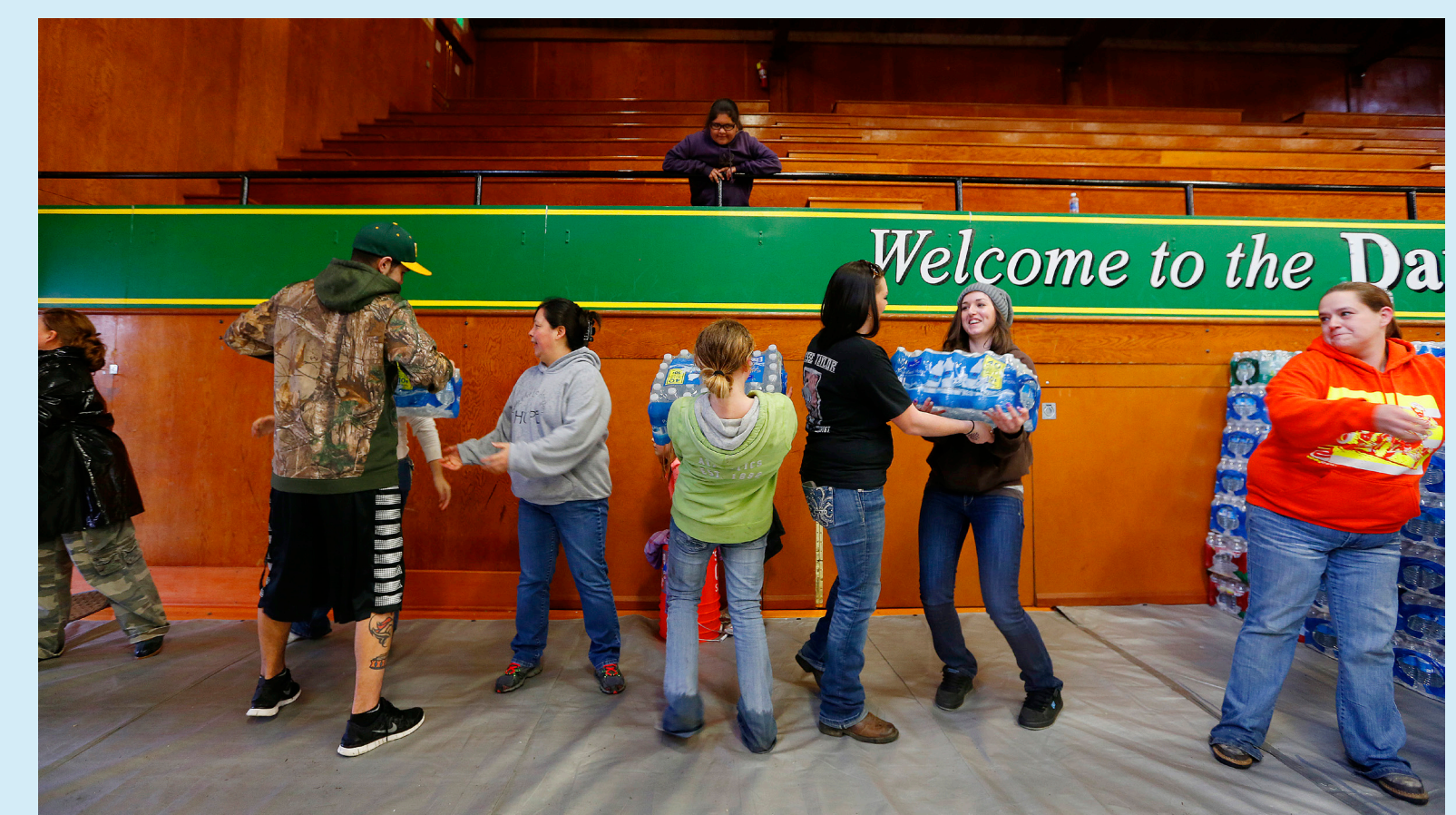
At top, friends and neighbors march into the debris on the Darrington side of the landslide to search for survivors; at bottom, volunteers at the Darrington Community Center stack packages of donated water.

The recovery of the Darrington community will be a long one. Our project helps to ensure their story will not be forgotten.