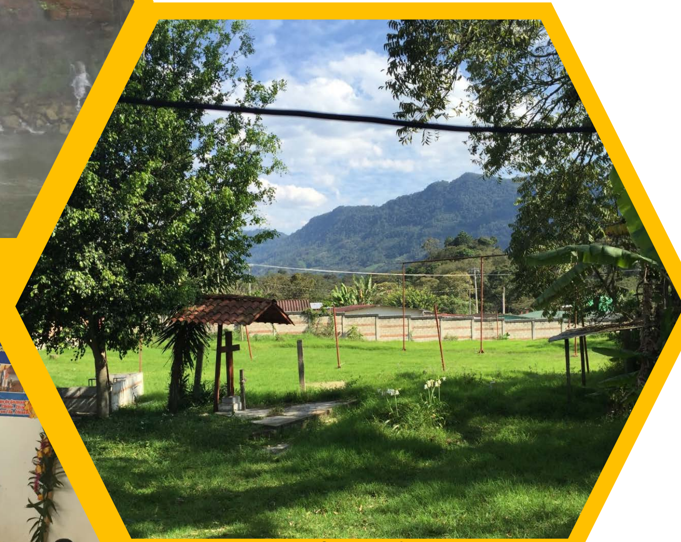
View of Los Altos - The Highlands – from the Colegio 2