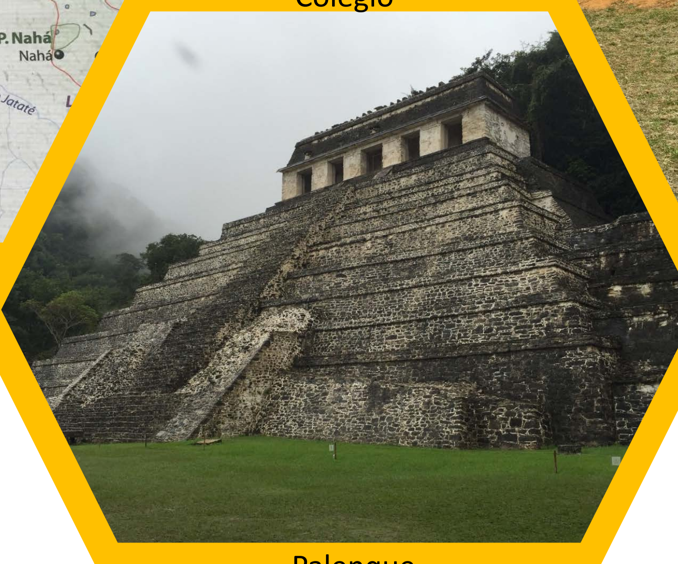
Palenque, Mayan archaeological site 2