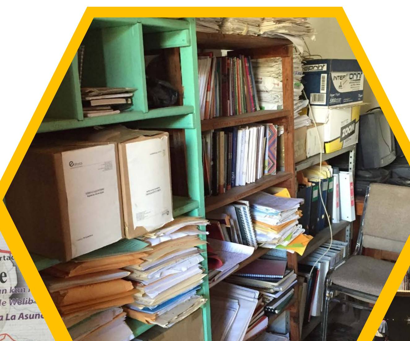
Some of the collection at Jesuit Colegio 2