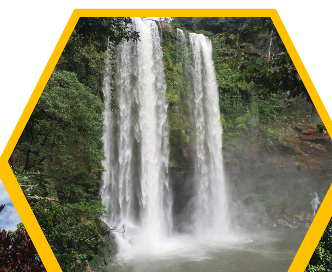
Misol Há waterfall, near Palenque 2