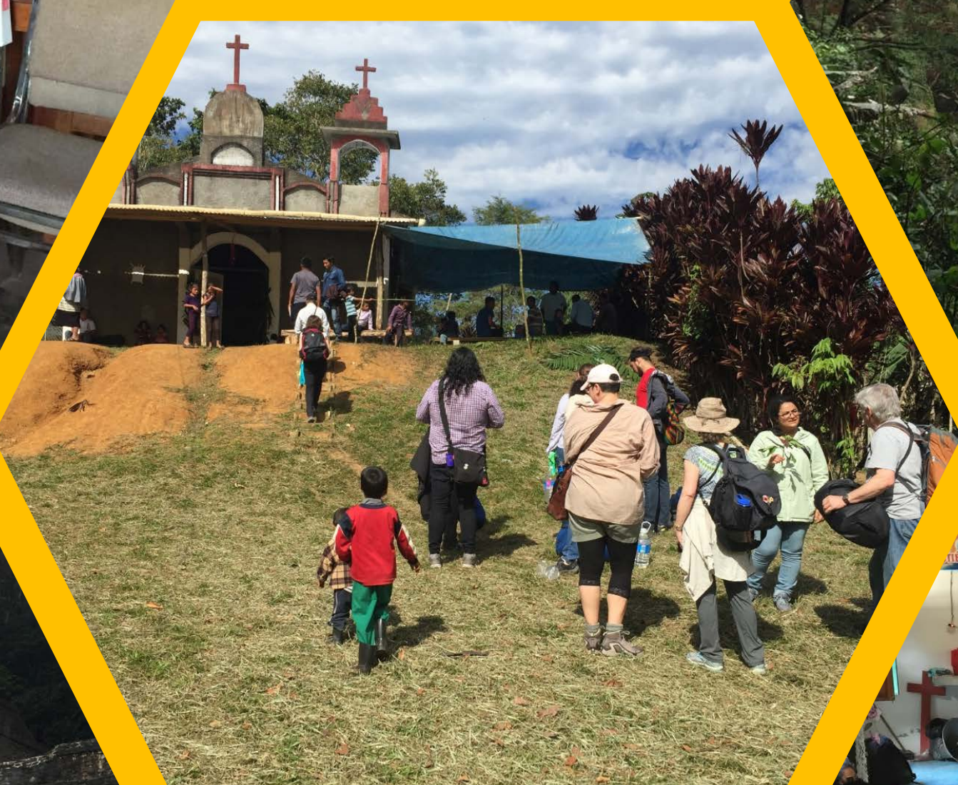
Arrival at Tiakil, Tselal community near Bachajon 1