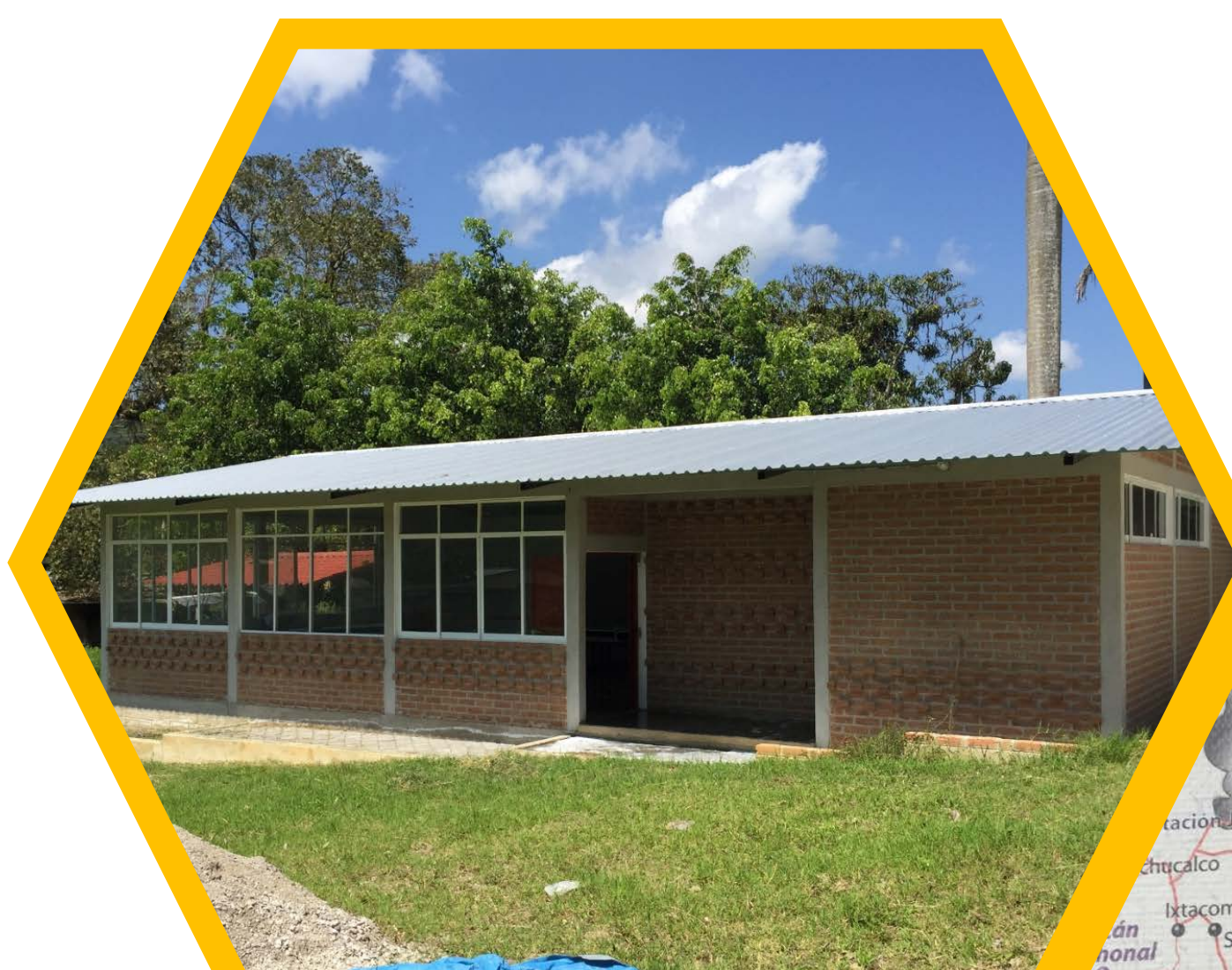
Newly built! Tselal House of Wisdom 2