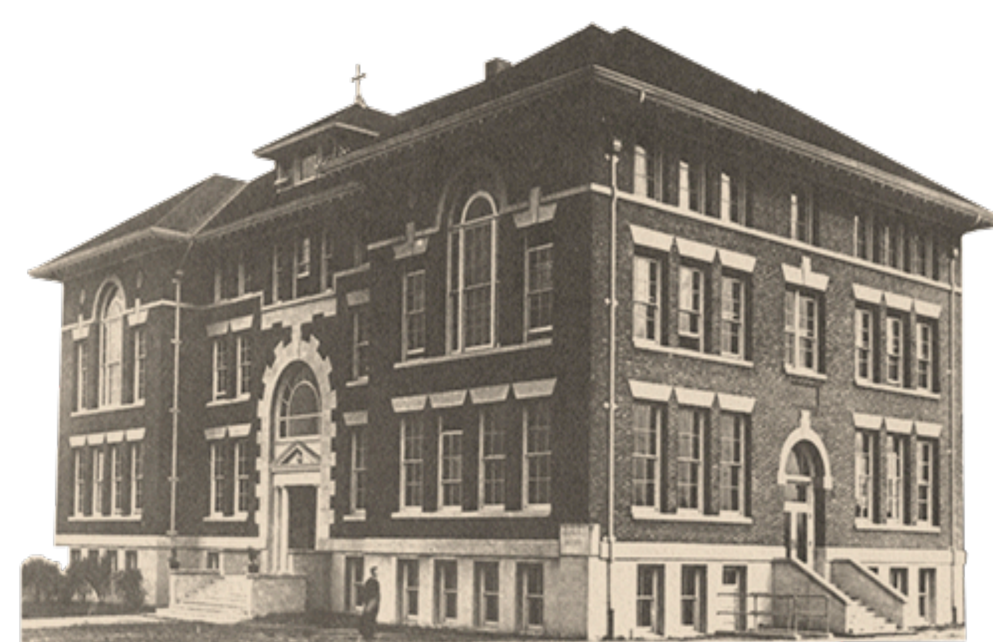
Adelpia Hall. www.seaprep.org. Web. 7 May 2016.