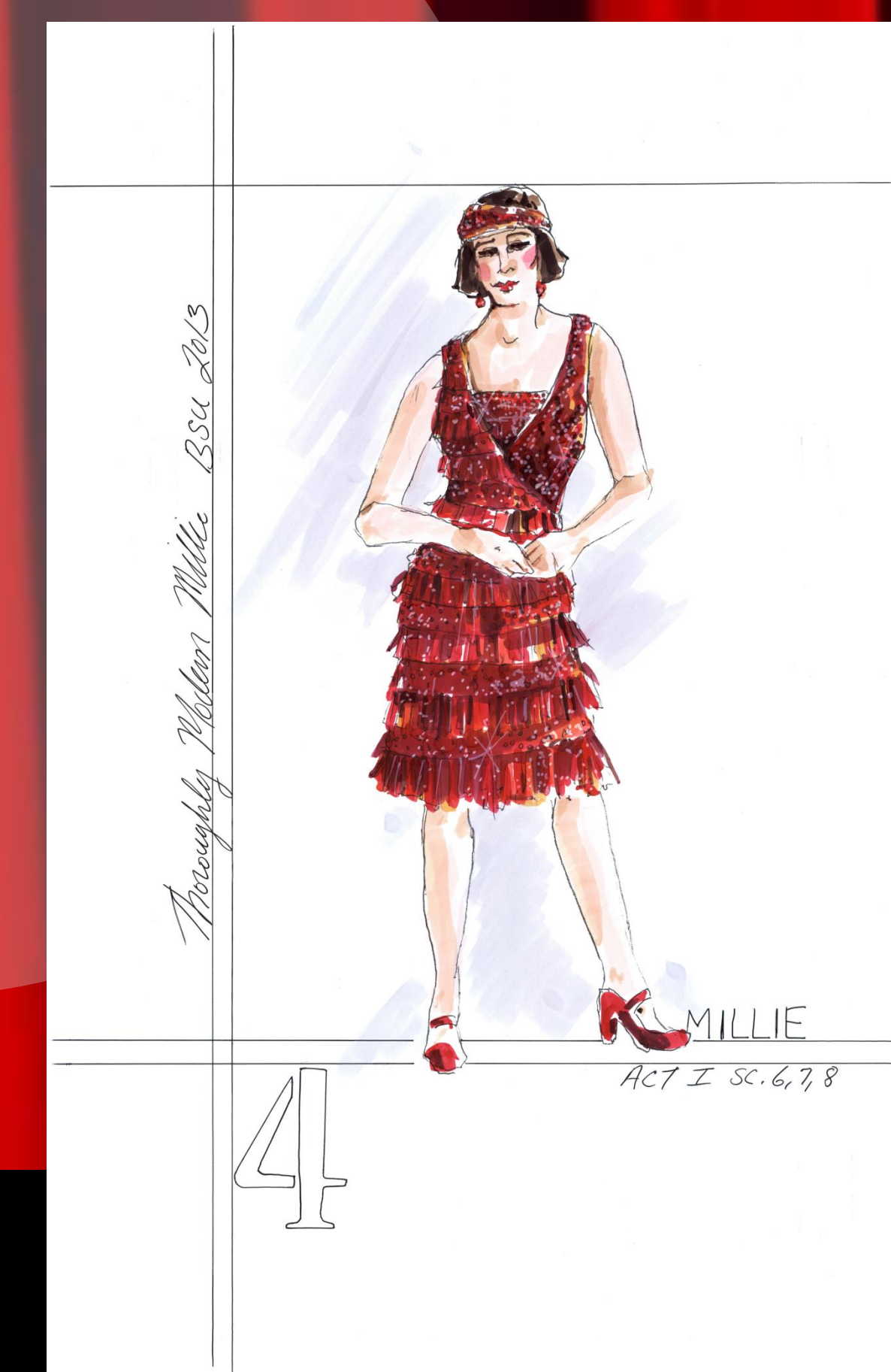
Published version of rendering by Darin J. Pufall (Dress worn in lobby poster) doi: 10.18122/B27P46