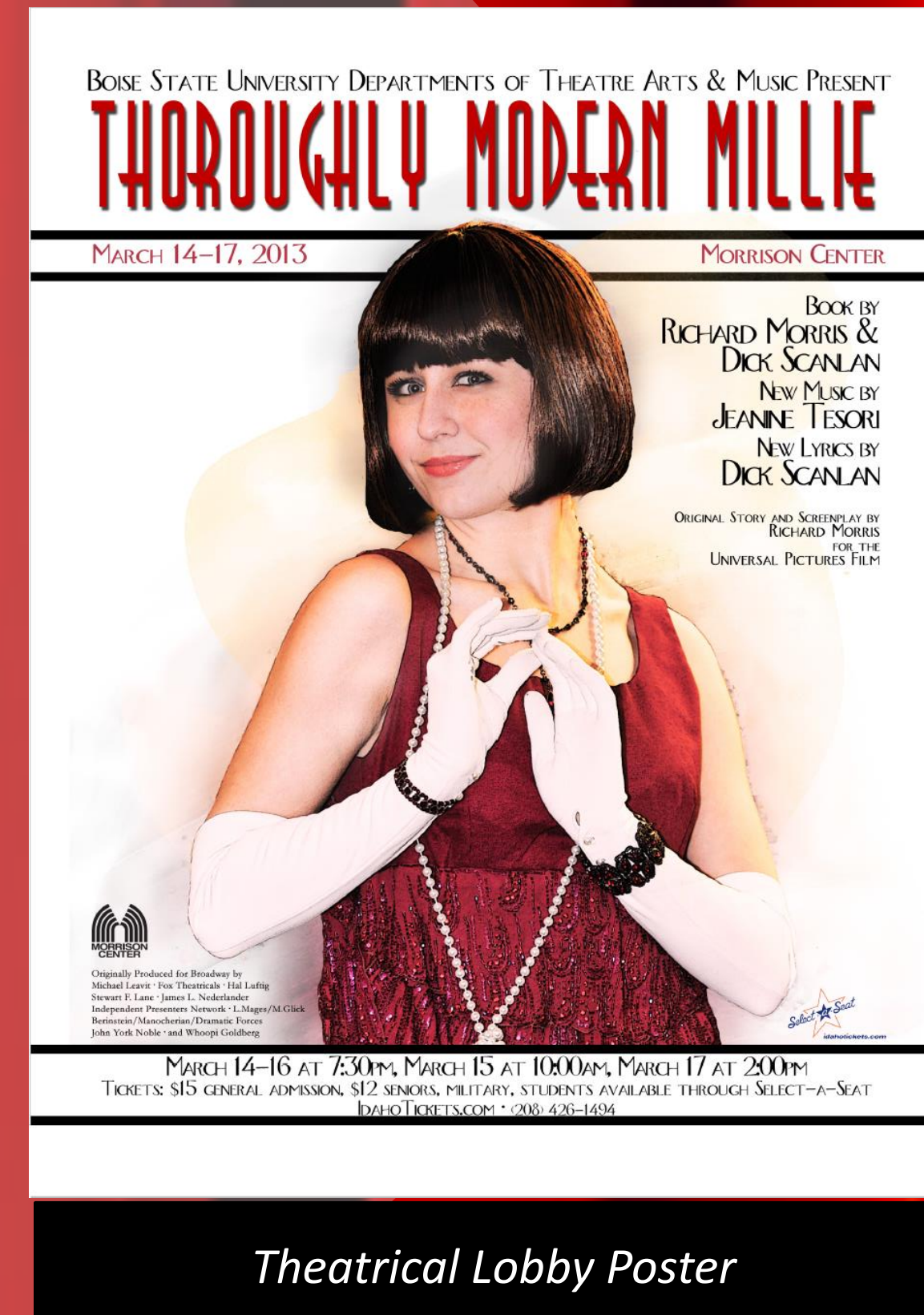
Theatrical Lobby Poster