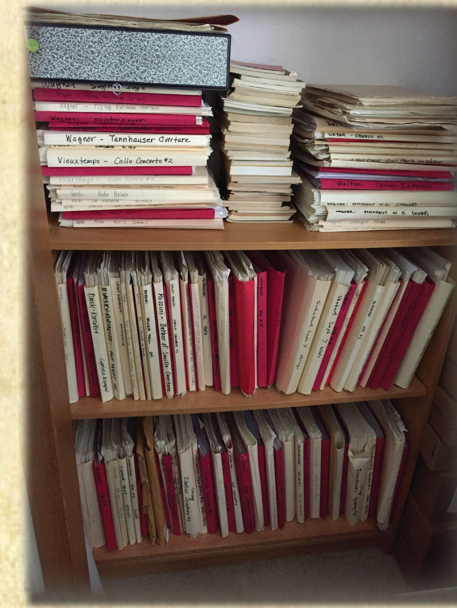
The collection is stored in closets at the music librarian's home

With those criteria in mind, I found musiclibrarian.net , an independent website that offered everything we needed. The BSO board selected it from a range of options and I signed up for an account.