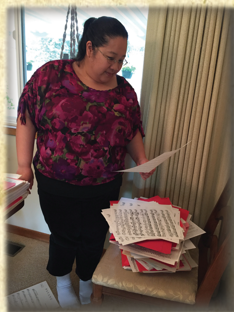
A team of helpful volunteers inventoried and weeded the collection