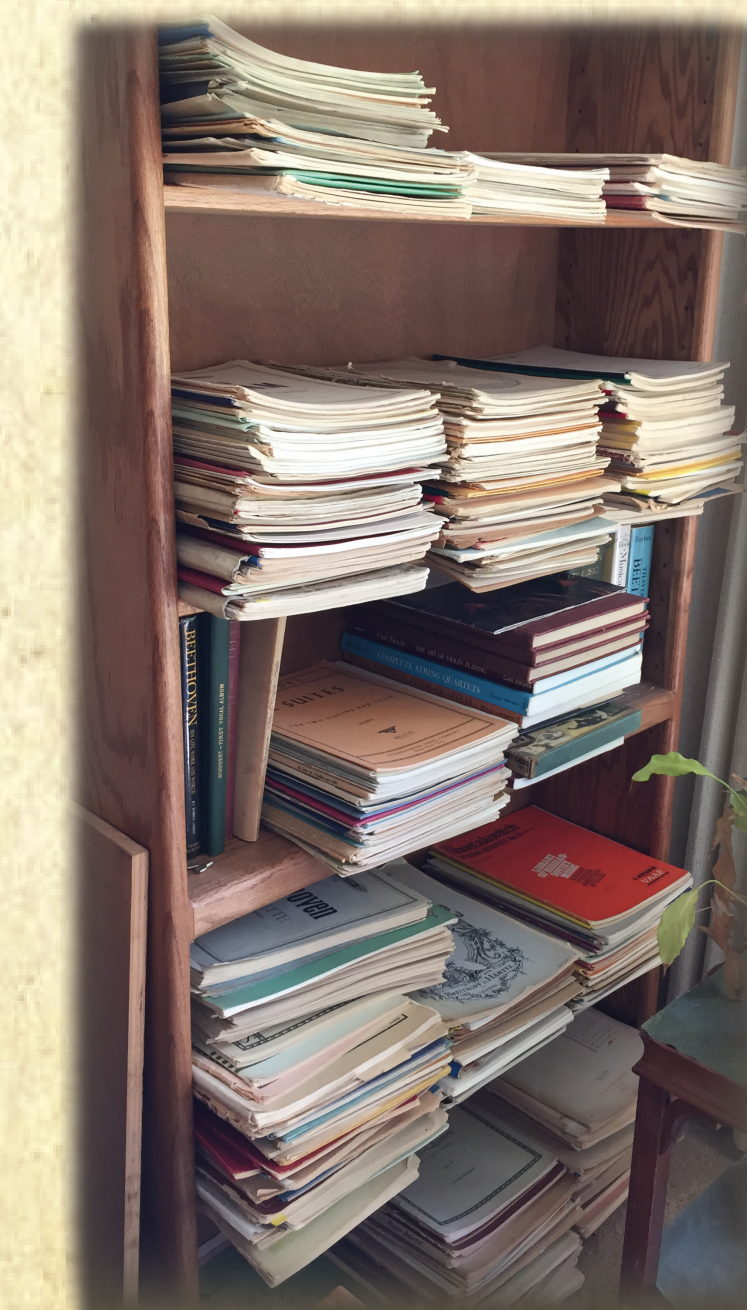
A large donated collection of chamber music will be added to the catalog for future orchestra use

The BSO recently received a large collection of chamber music, which has not yet been cataloged. This music will be inventoried and added to the catalog in the future for symphony members to use in the BSO's annual chamber music concert and at other performances in the community.