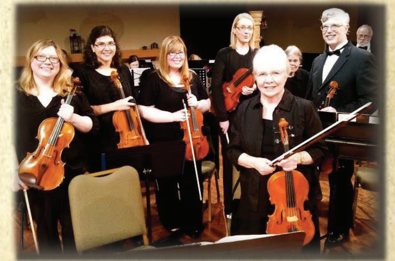
The BSO viola section

BSO's mission is to provide quality, live classical music at affordable prices, and to give local musicians a place to play together. The symphony is also dedicated to classical music education and enriching the community. Having an online music catalog will make it easier for the organization to access its existing music collection, as well as freeing up more time to expand its mission to serve the community.