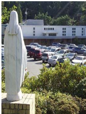
St. Luke Catholic Church

St. Luke Catholic Parish was founded in 1954. It is located in Shoreline, WA.