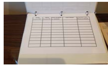
Check in/ Check out