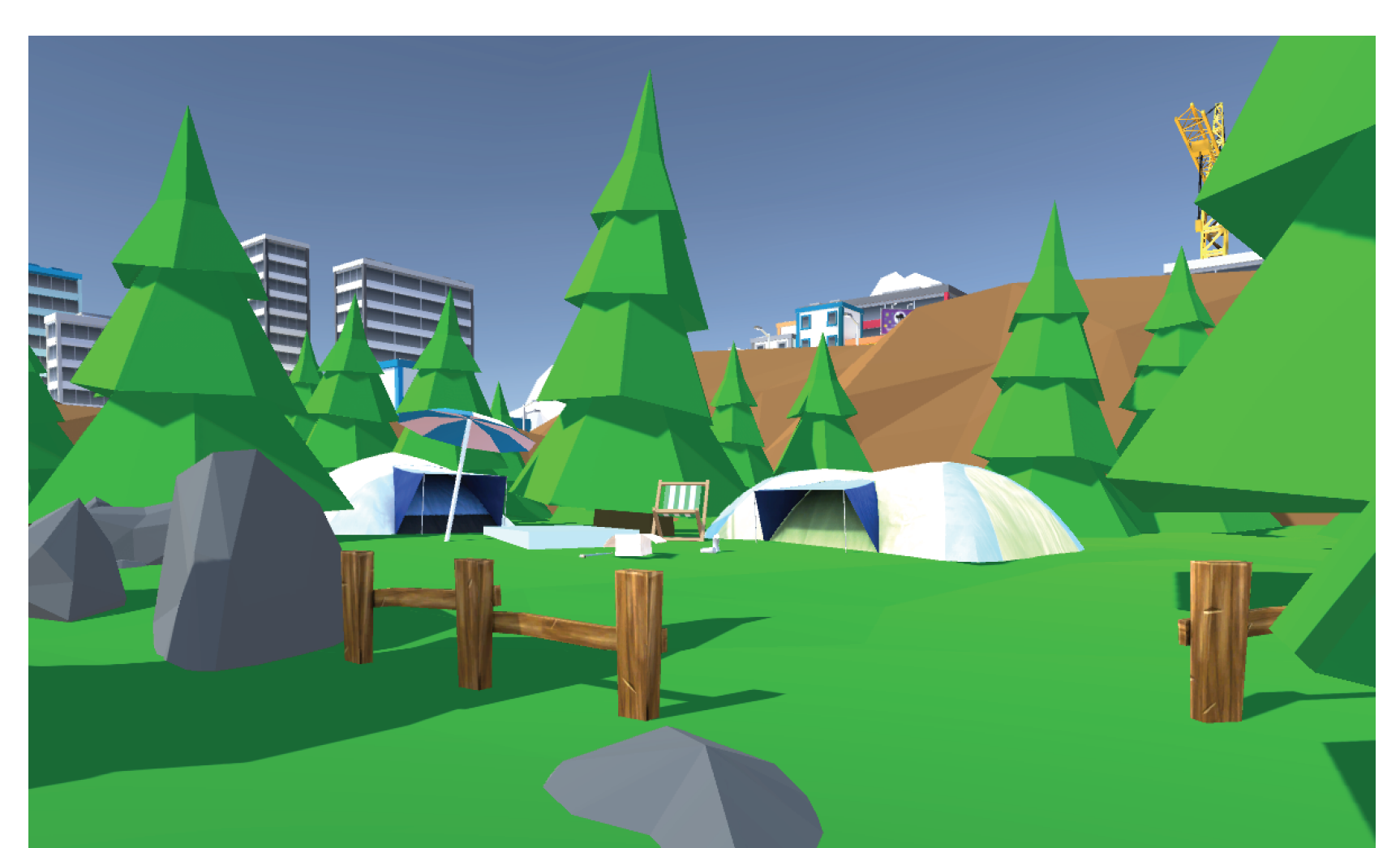
Deep storytelling and interactions grounded in community research