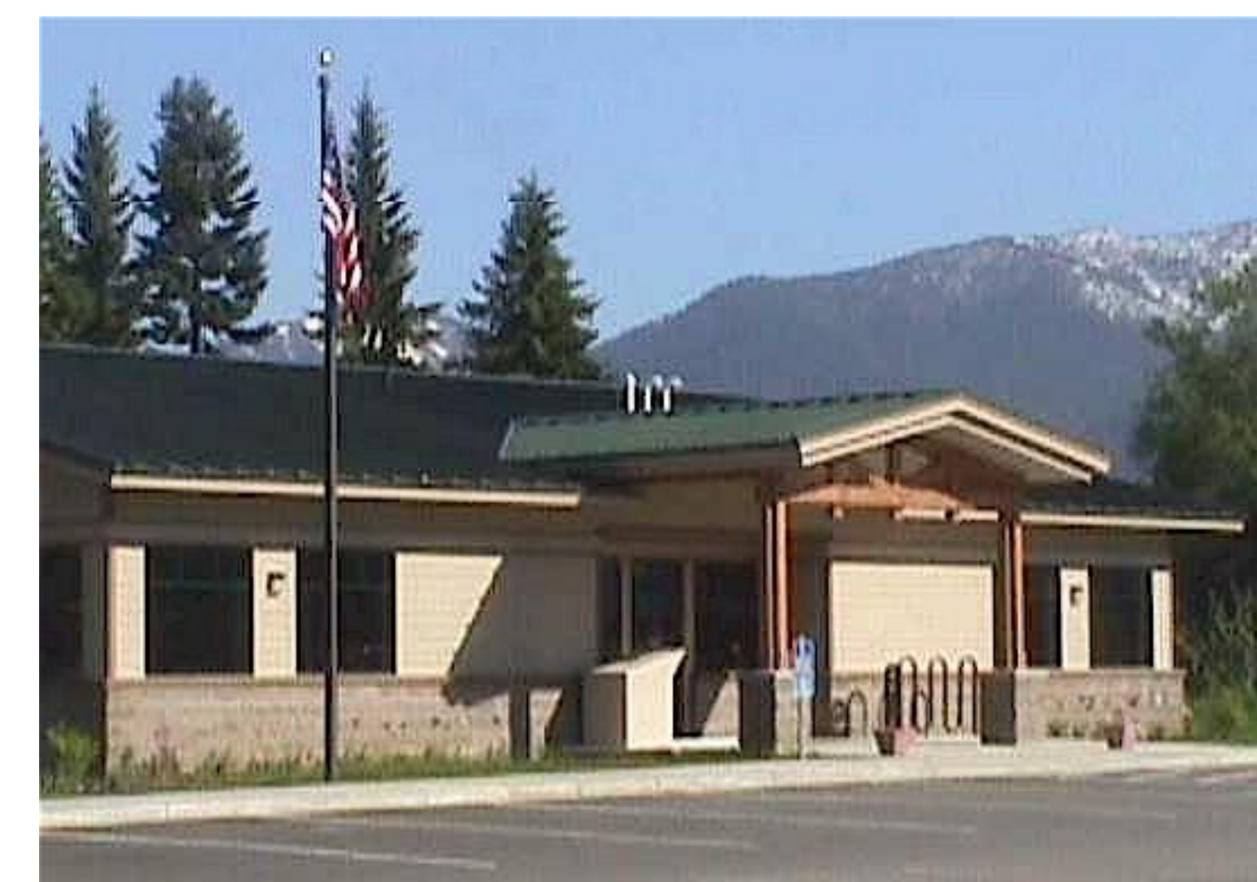
Clark Fork Branch