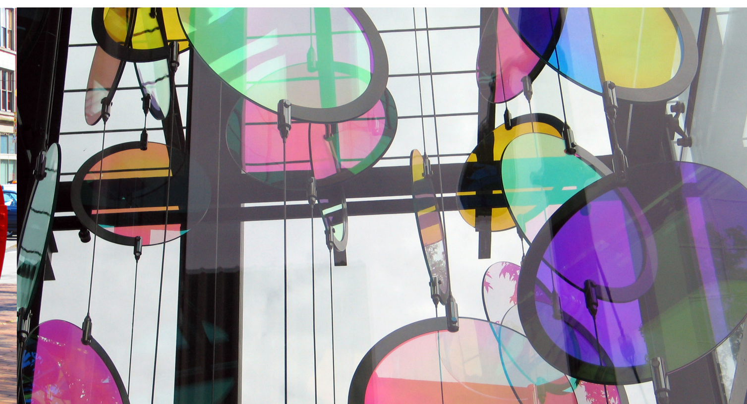
ARTIST: BELIZ BROTHER, ILLUMINE FFD05