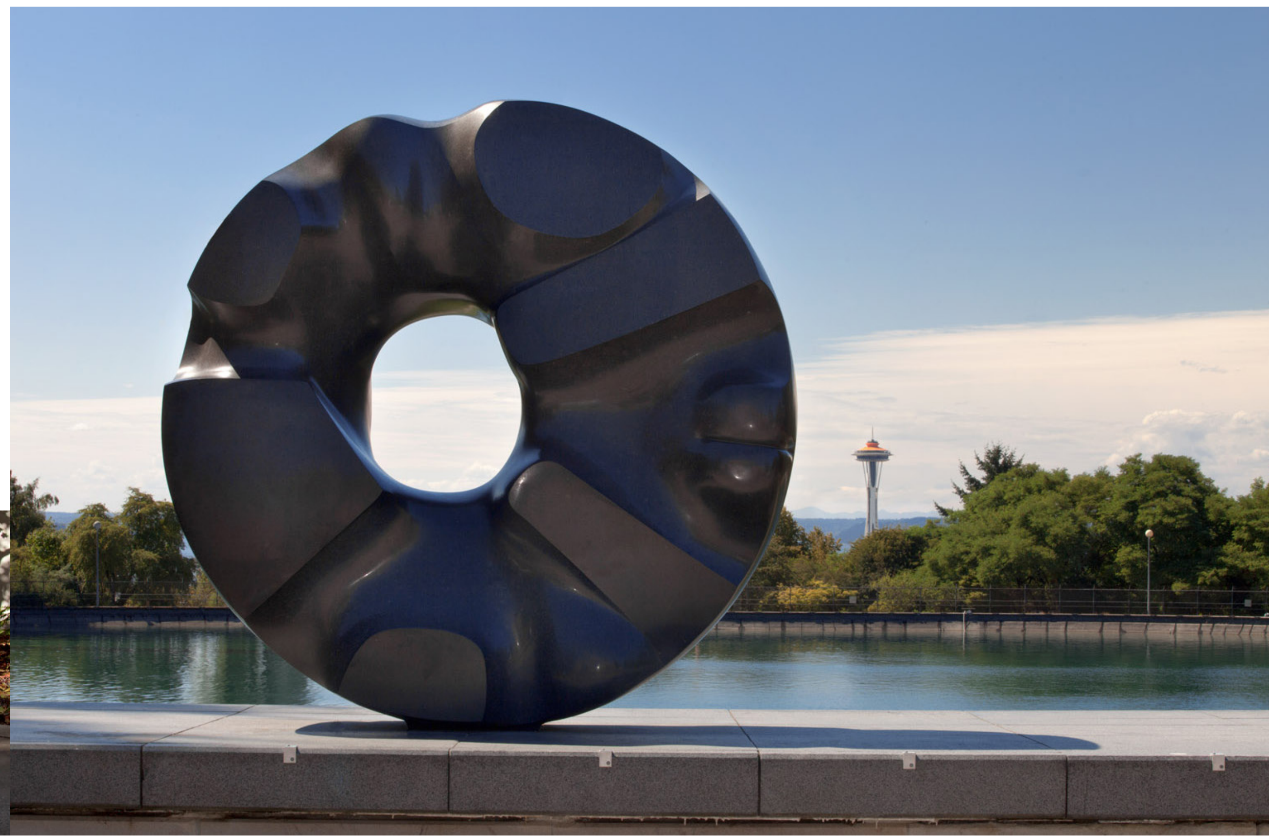
ARTIST: ISAMU NOGUCHI, BLACK SUN