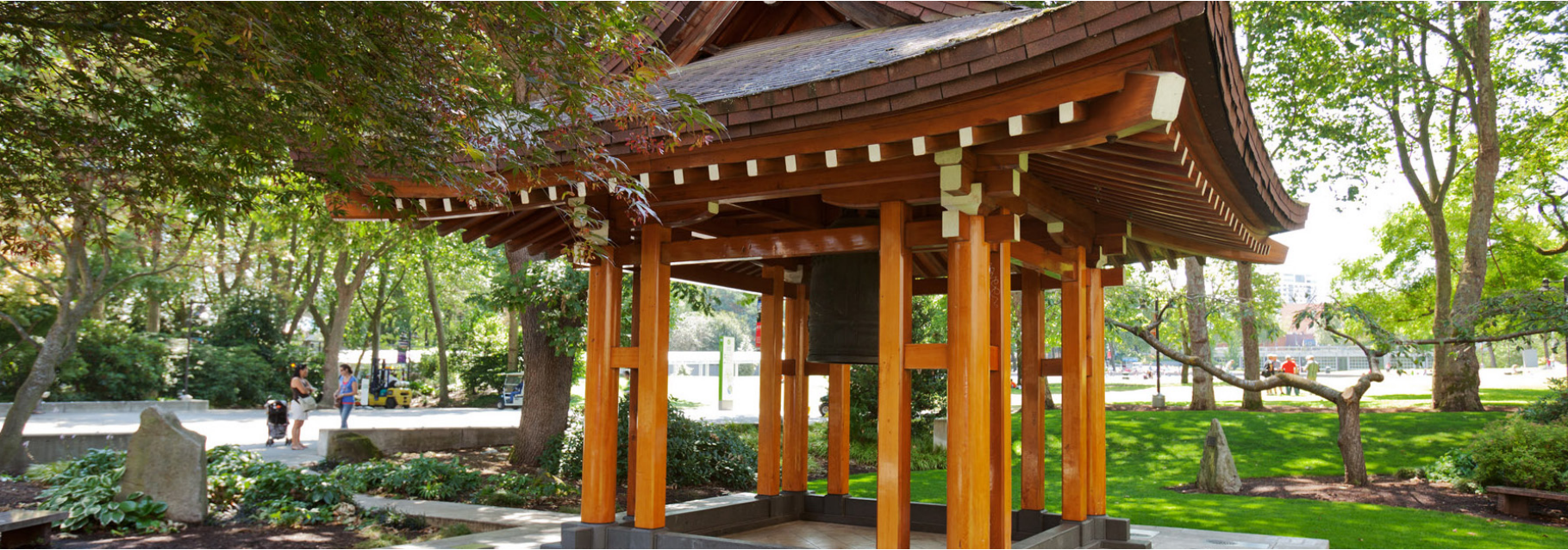
ARTIST: UNKNOWN, KOBE BELL