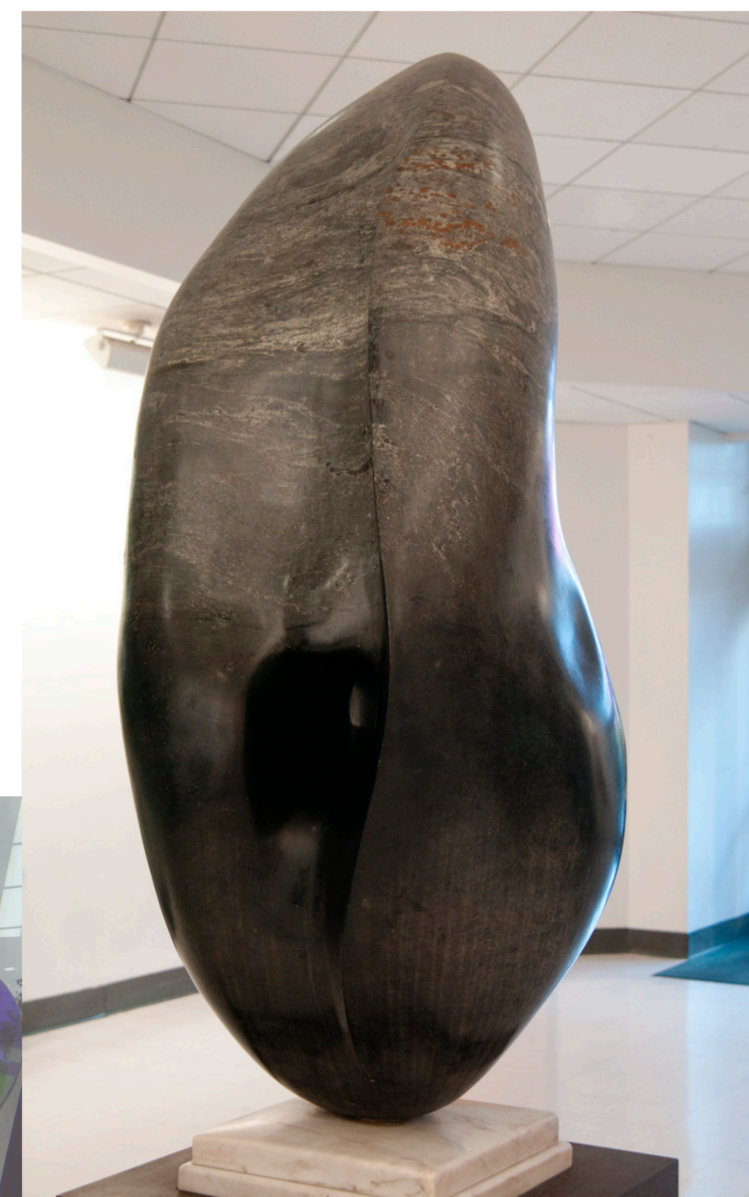
ARTIST: RITA KERNER, HUMAN FORMS IN BALANCE

www.seattle.gov/arts & www.publicartarchive.org