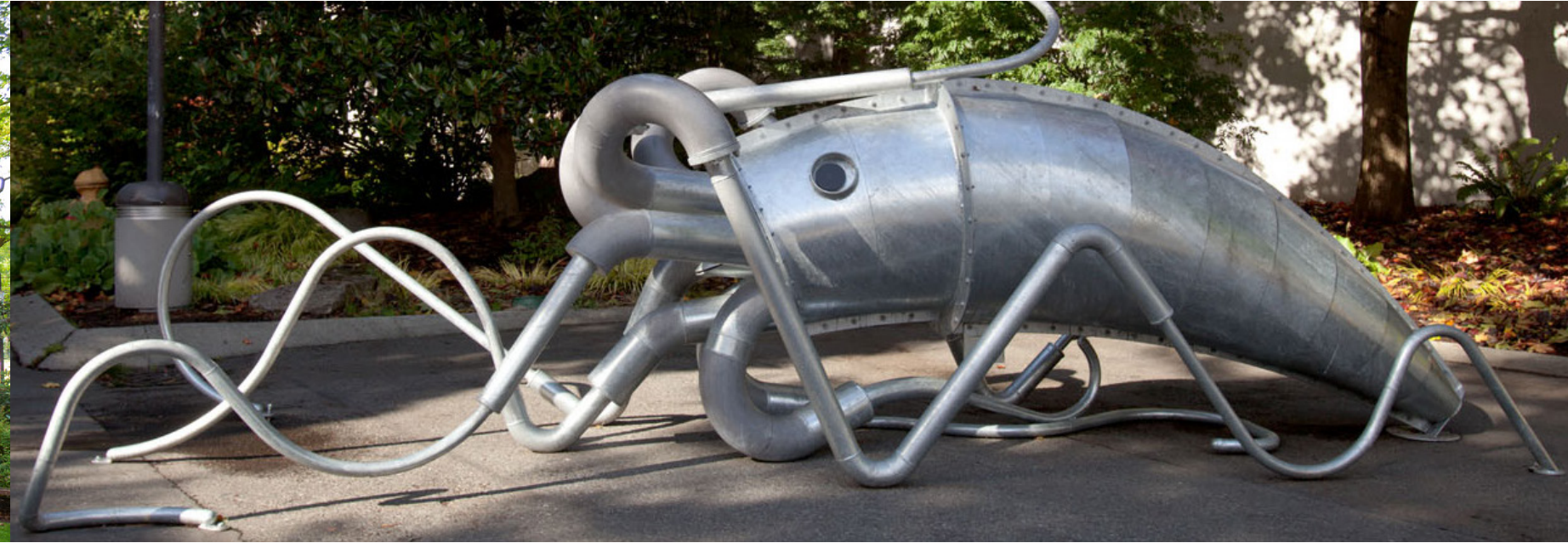
ARTIST: SUSAN ROBB, PARKING SQUID