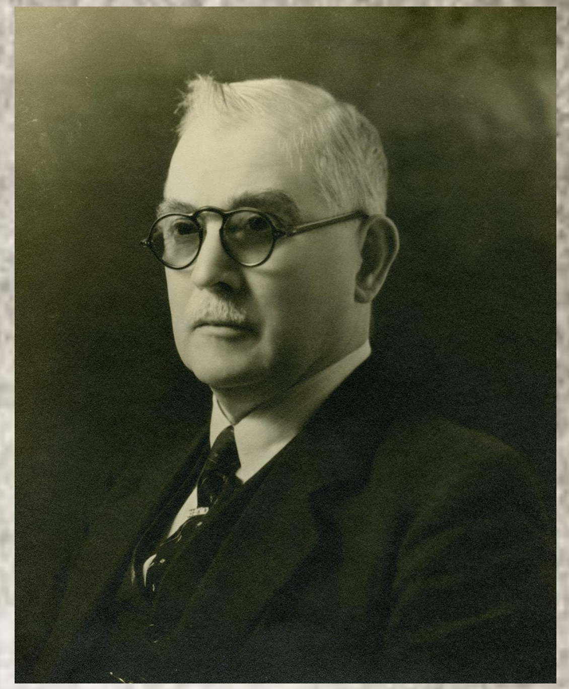
Judge George Bagley