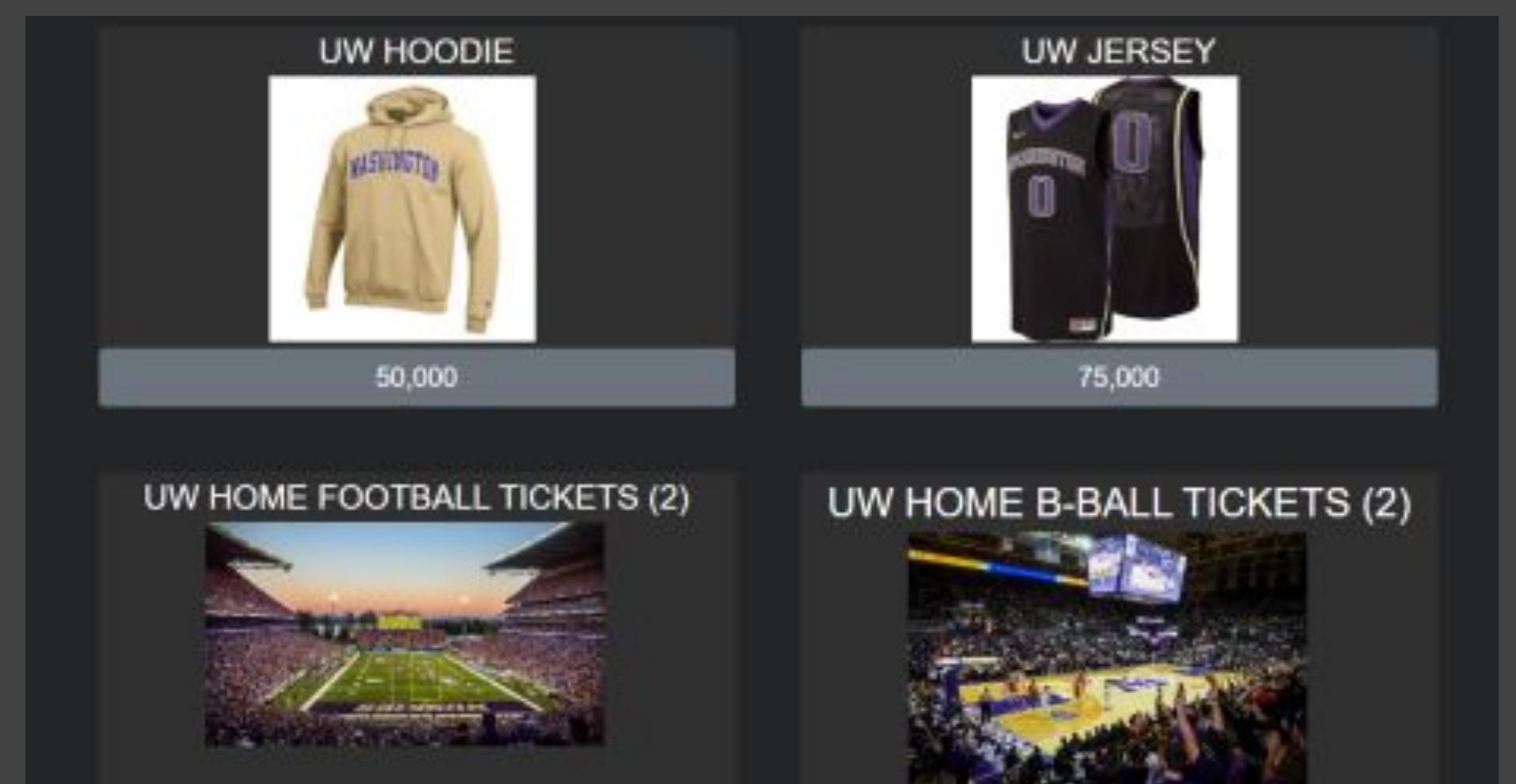
Rewards center earned by actively supporting a team