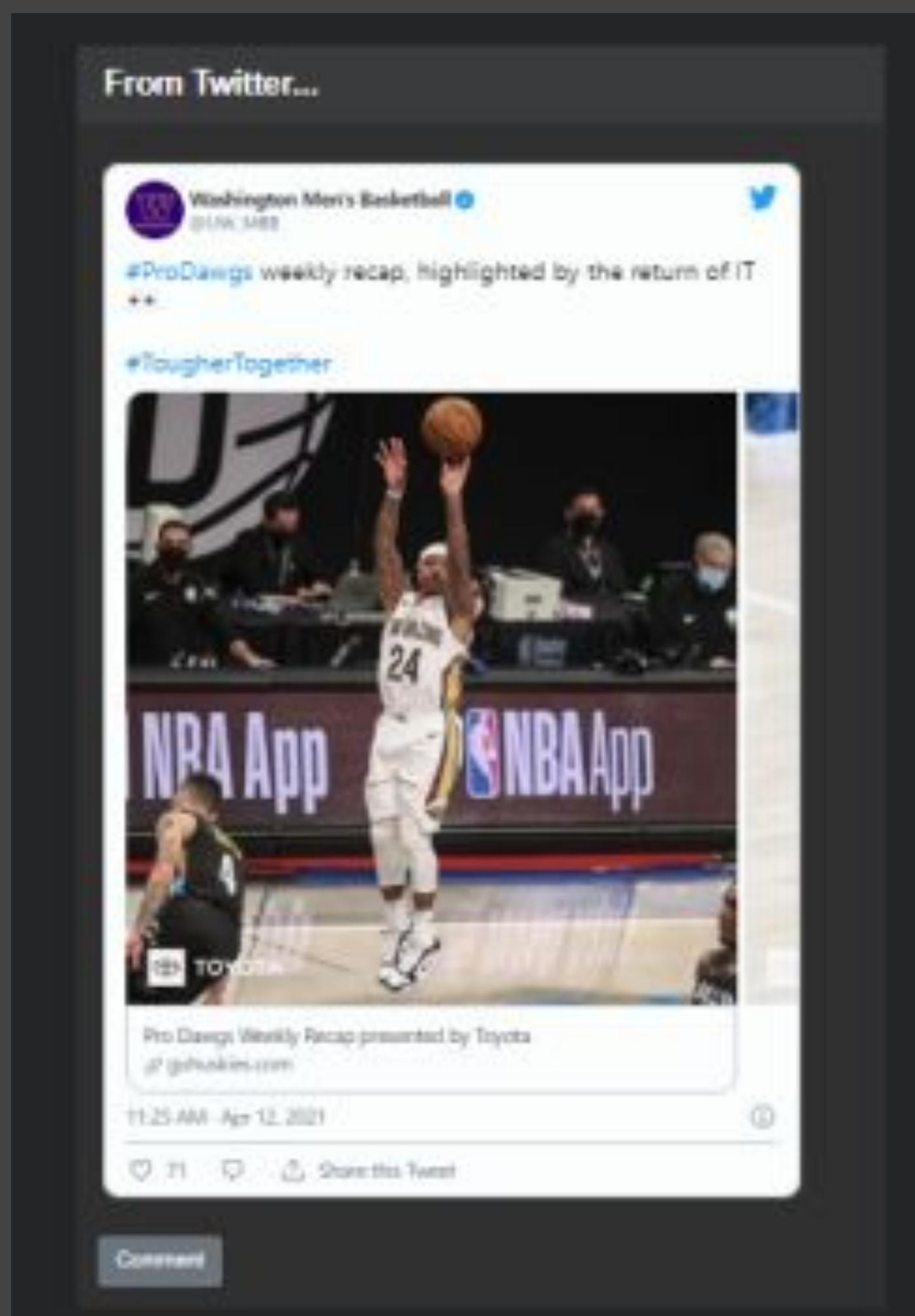
Aggregated posts from social media for fans to interact with