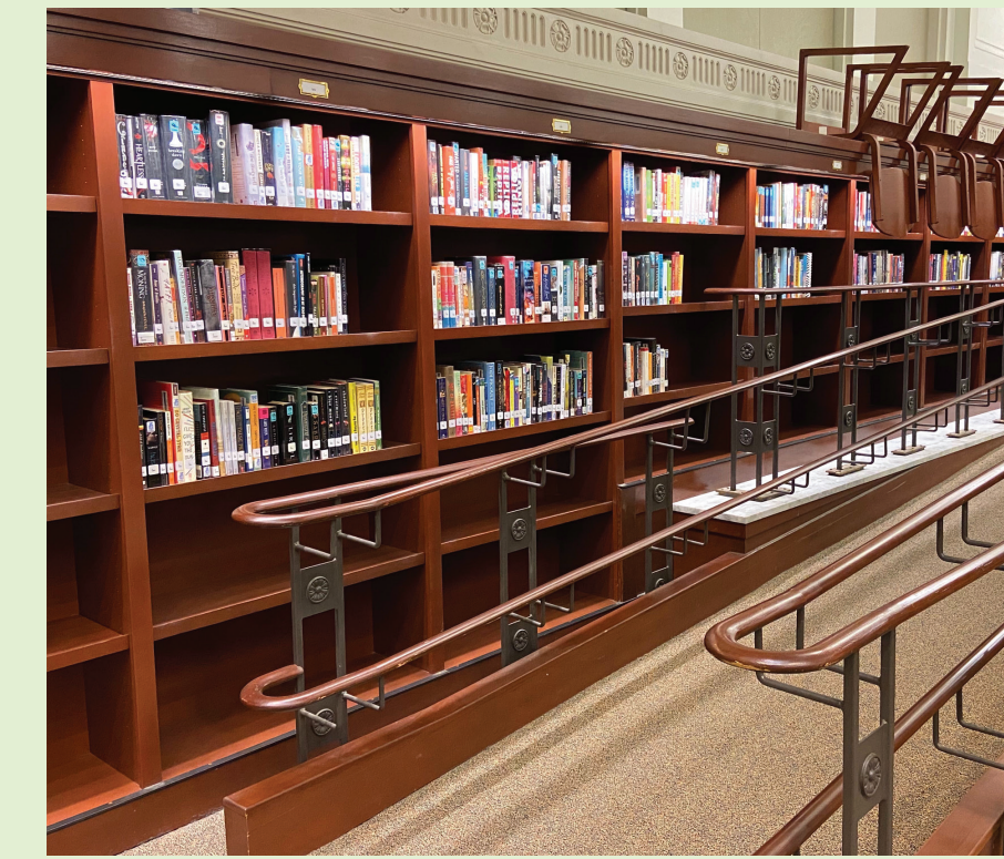
Bookcase built behind accessibility ramp.