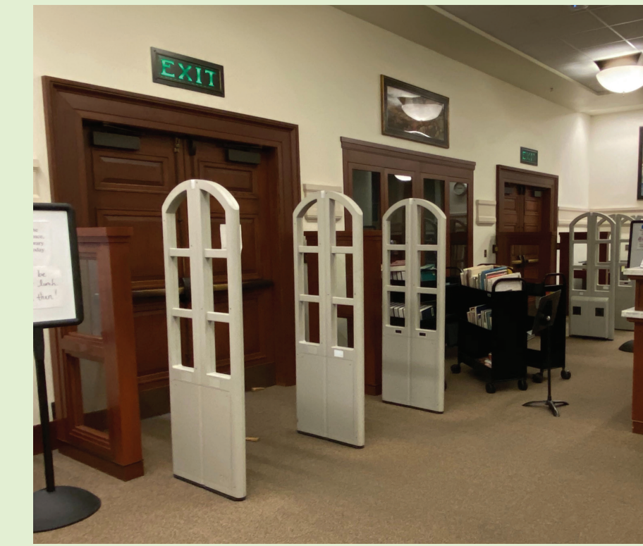
Unused security gates block access to displays.