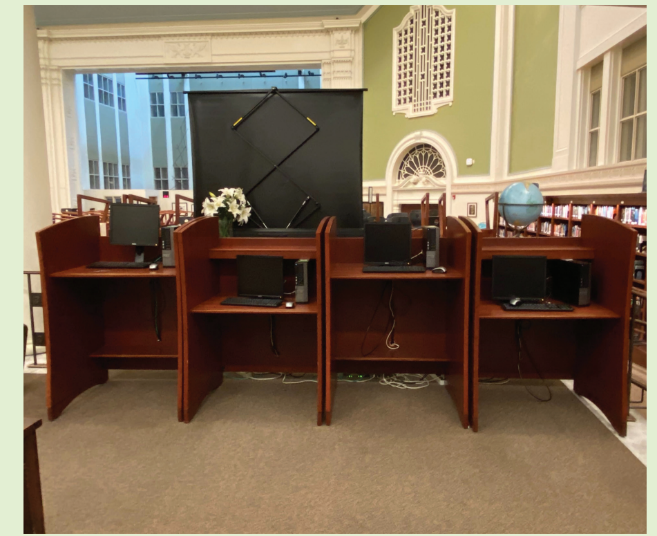
Study carrels and desktop PCs unnecessary with 1:1 laptops.