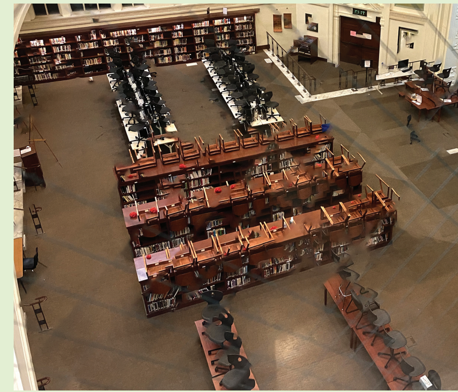
Large immovable shelves impede flexible use of space.