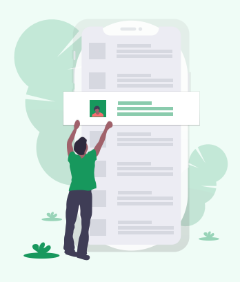
3. Manage your current items