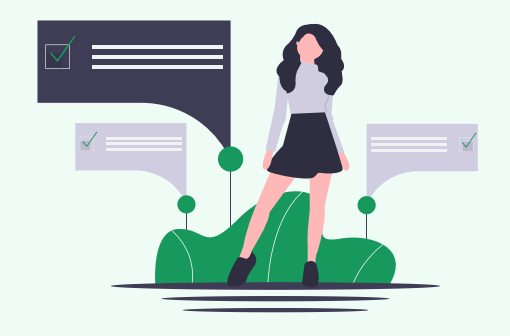
2. Get notifications before your products expire