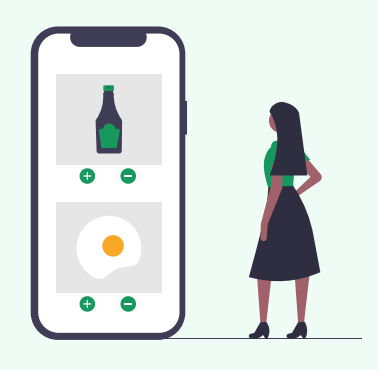
1. Scan barcode to get expiration dates