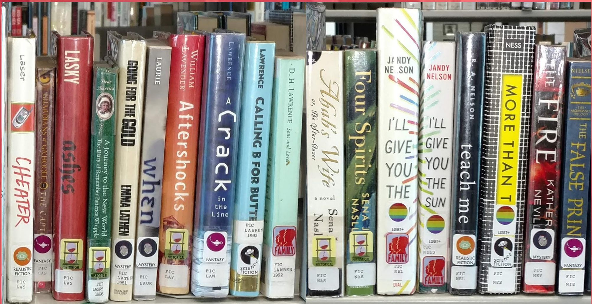
Some re-catalogued materials in their natural habitat