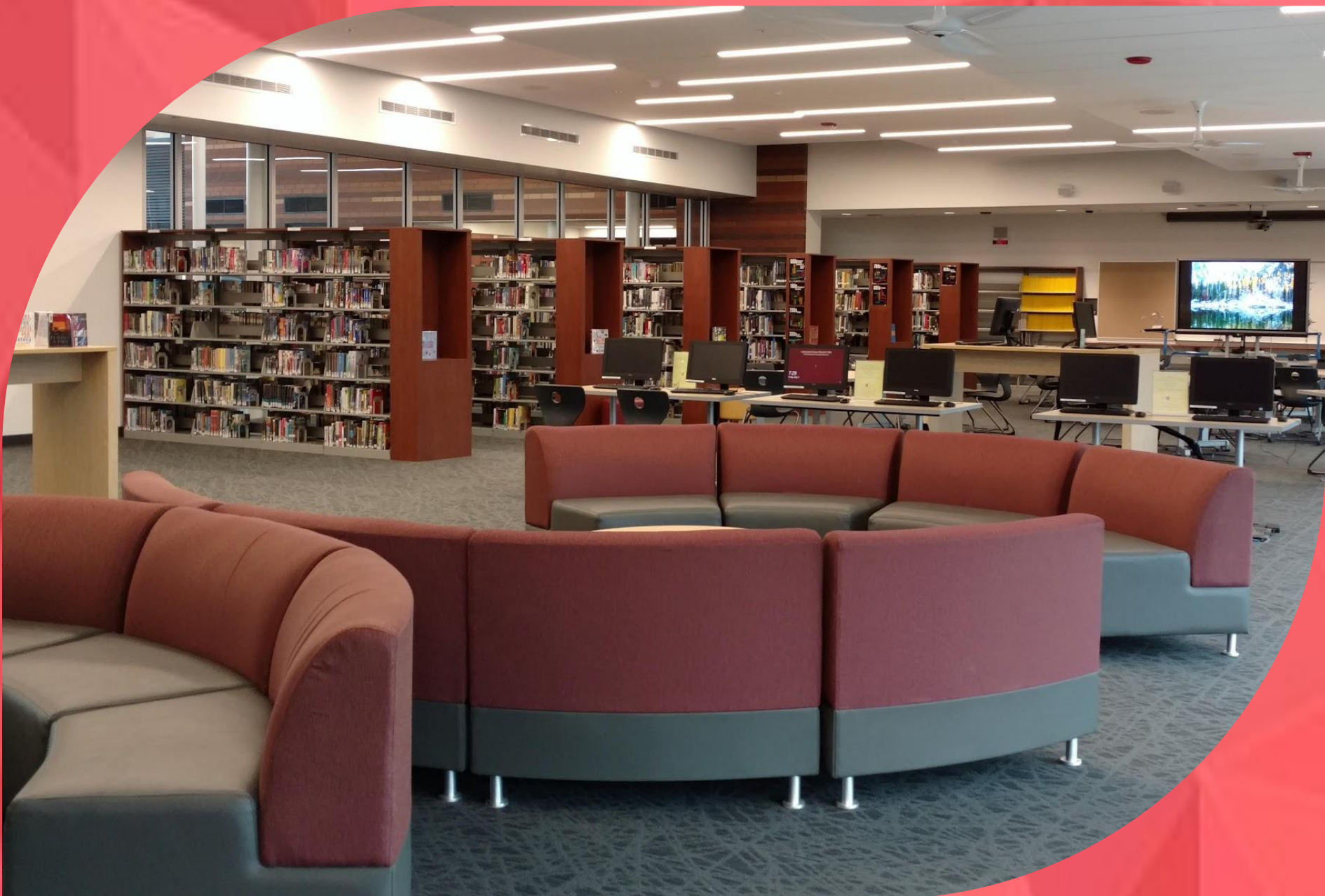
Lakewood High School Library: The first four shelves are the fiction collection