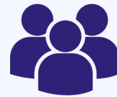
Lack of Support and Trust