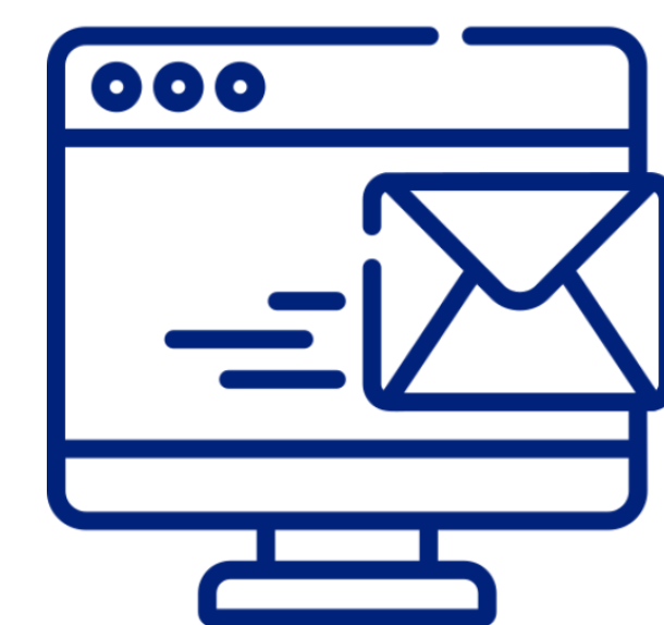
workSafe alerts Human Resources that a new report has been created