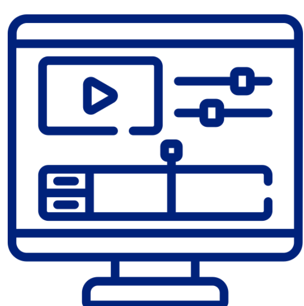
Reporter can view that their report has been viewed and where in the validation process their report is