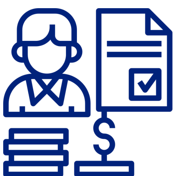
Human Resources Representative views report and changes state of the report