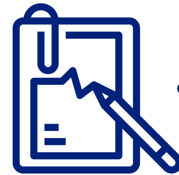
Reporters and all Bystanders submit reports and any evidence into workSafe