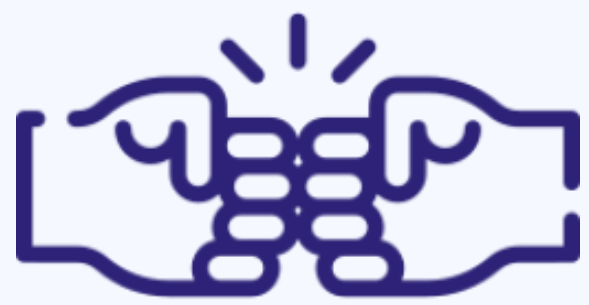
Fear of Retaliation