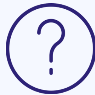
Unclear Processes and Reporting Systems