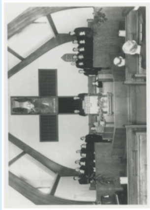
Sanctuary with choir ca. 1940s

Leaders hope to post this information online and create policies for public access to parts of the collection