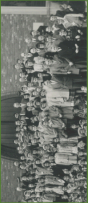
Members photo 1940s