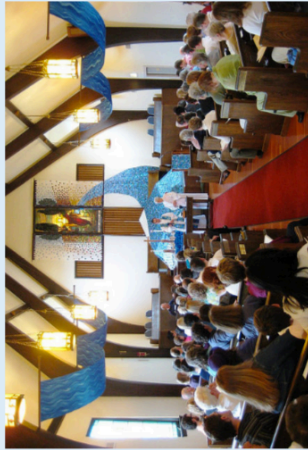
Celebration of Communion ca. 2008

Offer recommendations on records management and preservation to ensure the archives are kept by the church for years to come