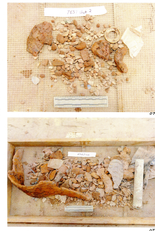
Photos from the forensic archaeology dig from the on-going search for San's remains