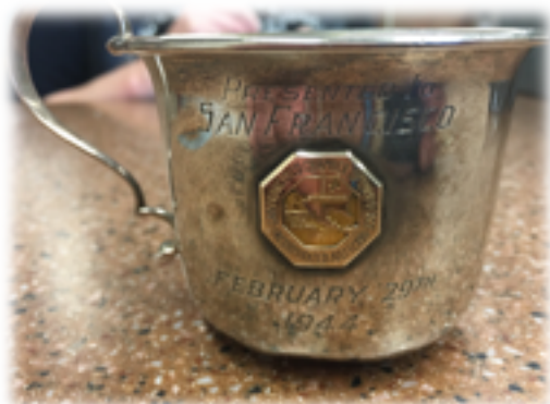
Baby cup given to San from City of San Francisco