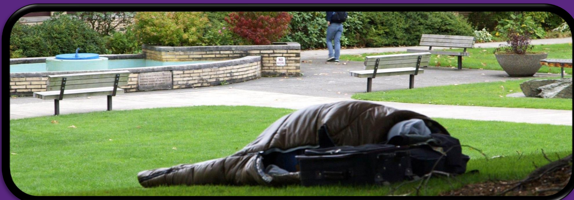
A person experiencing homelessness sleeps outside Bellingham Public Library.