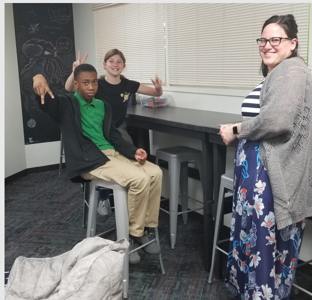
*Permission was received for use of photos.