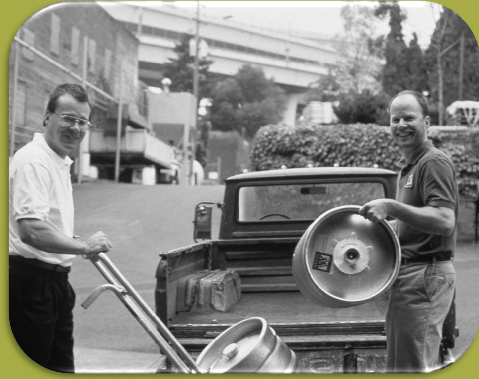
For many years, Widmer Brothers Brewing used a vintage Datsun truck for deliveries and to pick up grain and hops. In this shot, taken after they moved to Russell Street, the boys load kegs.