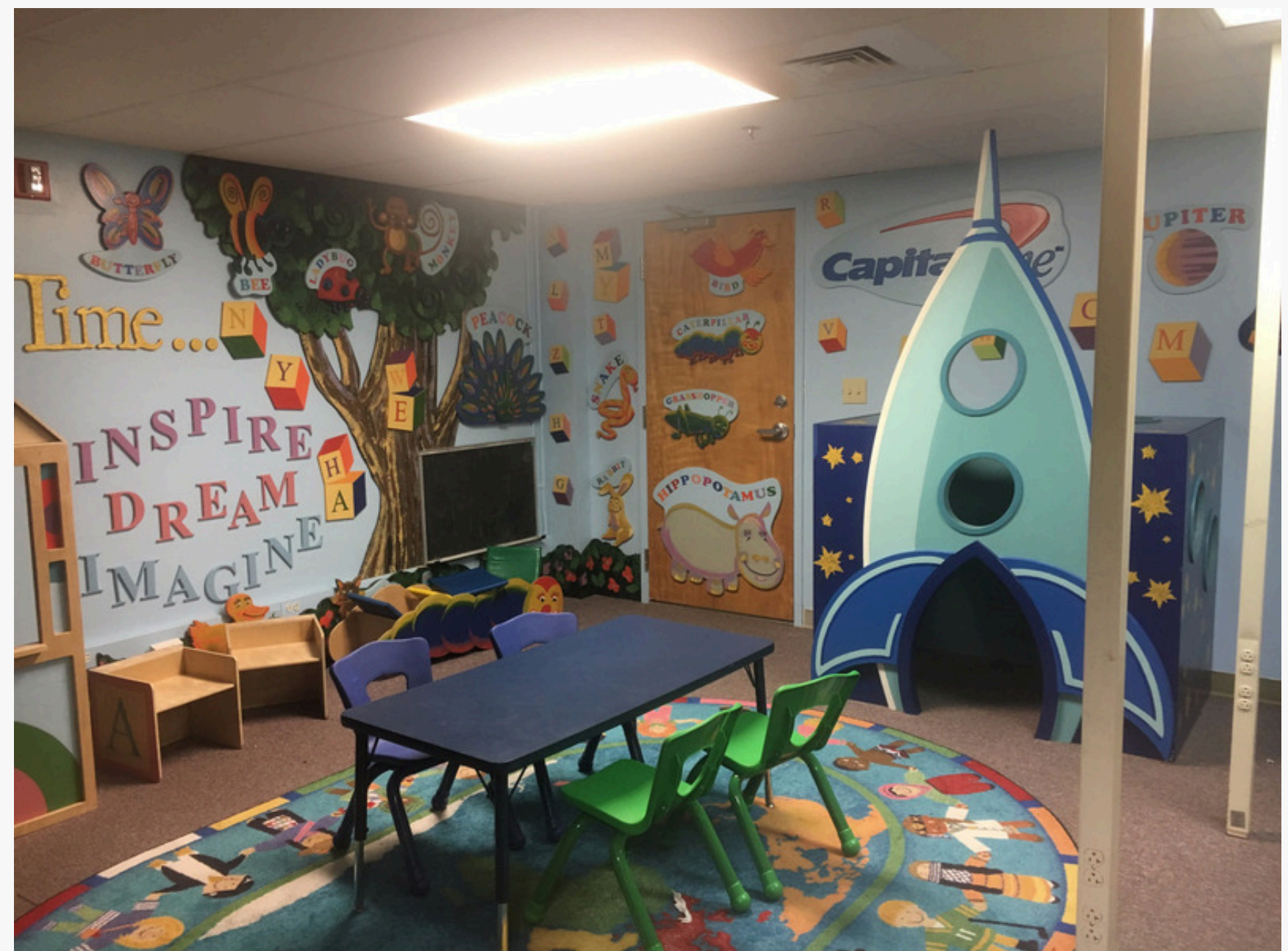
Santos Place Library Reading Room