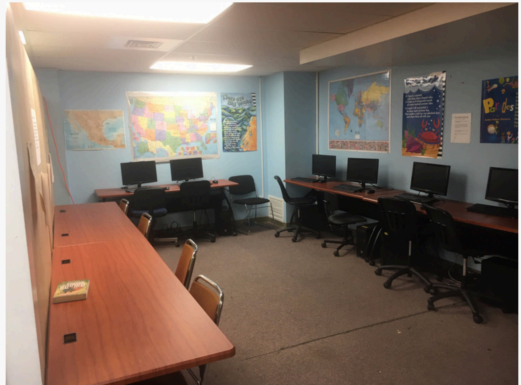
Santos Place Library Computer Room