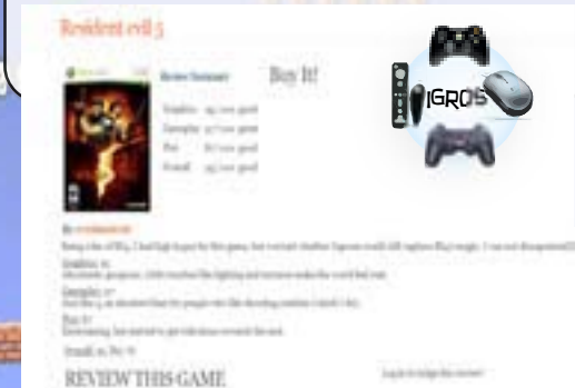
Example of game review page- free from distracting elements in a clean format.