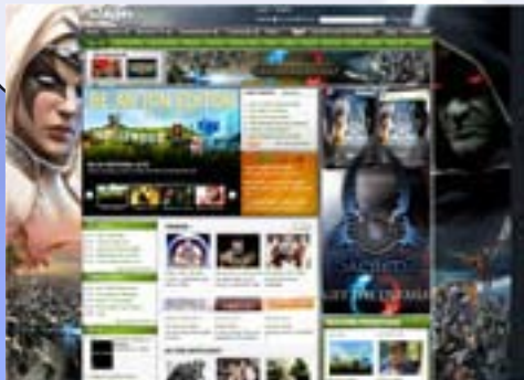
An example of a page with distracting page elements.